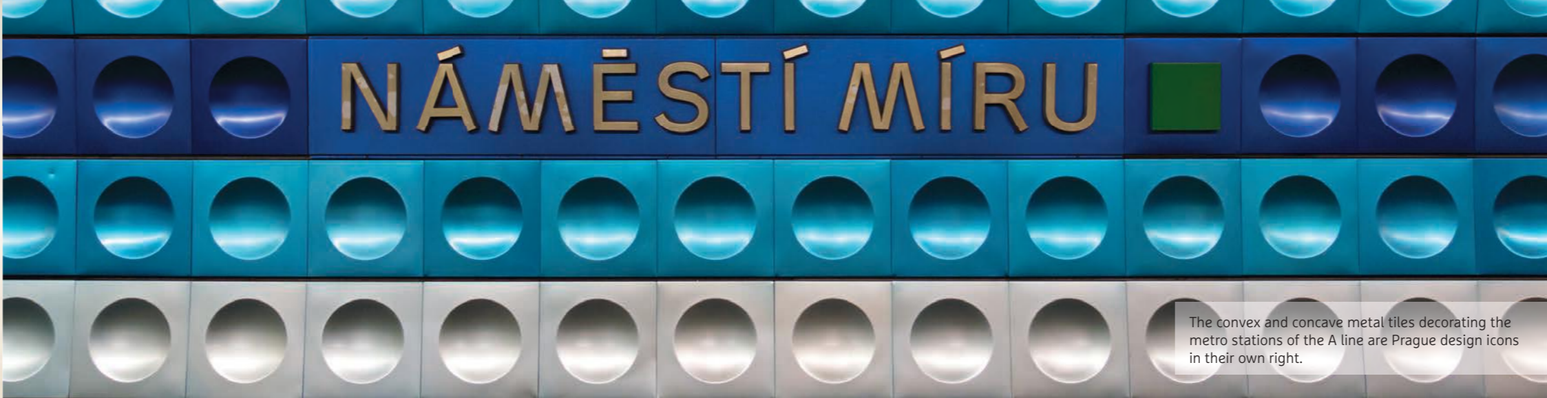
The convex and concave metal tiles decorating the metro stations of the A line are Prague design icons in their own right.

This imposing residential area has everything: elegant architecture, great restaurants and cafés, places of cultural interest, and greenery – all just a few minutes from the historical centre. Ornate Art Nouveau façades and streets lined with mature trees slightly evoke Paris – and we daresay the quality of cafés is equal – making Vinohrady a highly sought-after location. We'll give you an overview of the area around Náměstí Míru (Peace Square), the virtual centrepiece of this quarter.