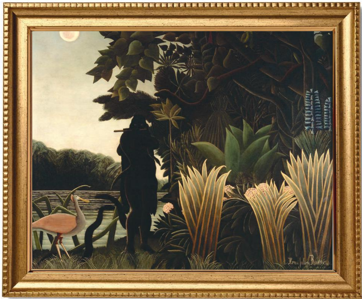
Henri Rousseau, The Snake Charmer , 1907, oil on canvas, Paris, Musée d'Orsay

This calendar offers only a small selection of the most interesting events that will take place in Prague from Dec. 2016 to early Mar. 2017; dozens of others are presented on our regularly updated website www.prague.eu . Here you can find more detailed information about events, tickets, and more.